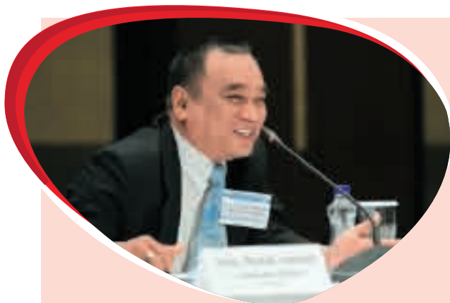
Then MyCC Commissioner Abd Malek Ahmad speaking at the OECD workshop titled International Co-operation in Cross-Border Competition Cases in Seoul, South Korea.