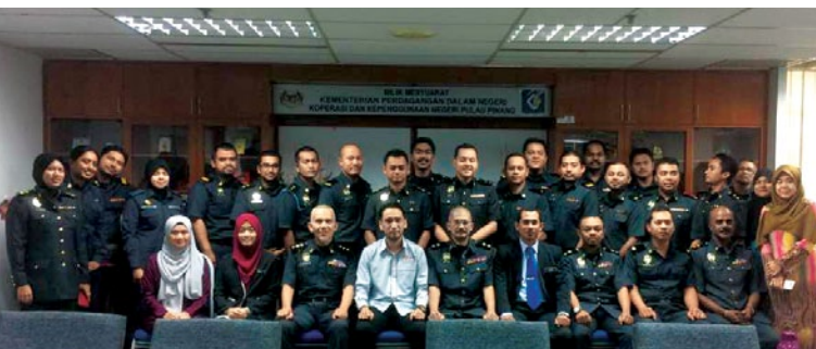
Esteemed members of the MyCC seated with the Enforcement Division from the Ministry of Domestic Trade, Co-operatives and Consumerism (MDTCC) office in Pulau Pinang.