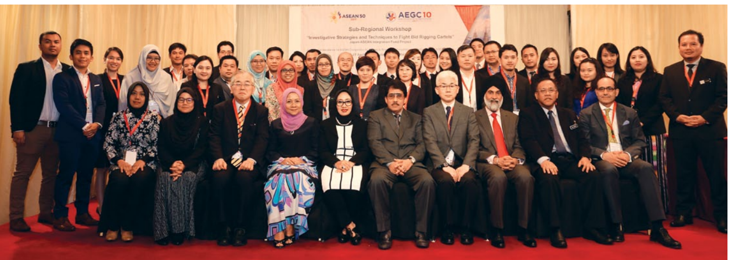
The Japan Fair Trade Commission shared their expertise during the workshop by creating in-depth discussions on bid rigging.

cases, practical investigative sessions on detecting cartels and other related issues. This provided an excellent platform for participants to exchange information, ideas and knowledge in order to further strengthen the principles of the Competition Act 2010.