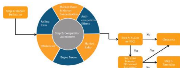
Case Study on Remedies and Commitments – Thomson/Reuters

The following diagram lists out the general steps CCS takes in its substantive assessment of mergers: